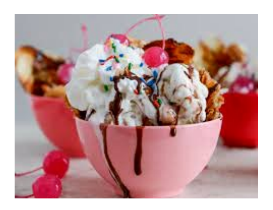
5 lucky homerooms will win an ice cream party. Get to school 9/20-9/24. You can make it!